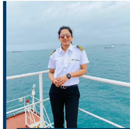
Proud ex-AEMA cadet on board

Nestled in a beautiful valley, surrounded by the Sahyadri hill ranges, along the banks of Ulhas river, few kilometres away from Karjat town in Maharashtra, lies ' Anglo-Eastern Maritime Academy ', an epitome of excellence amongst the Maritime Educational Institutions in India. Situated almost midway between Mumbai and Pune, Academy can be reached by road from Karjat which is well connected by Road as well as Rail network.