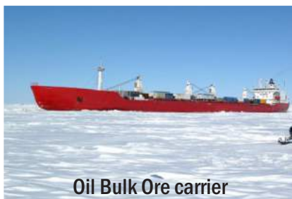
Oil Bulk Ore carrier