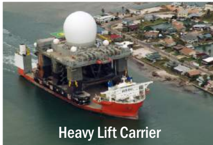
Heavy Lift Carrier