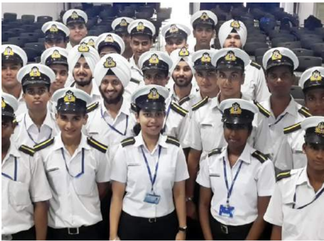
Proud AEMA cadets