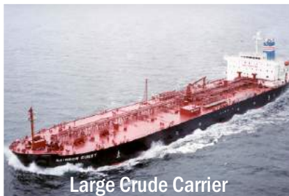
Large Crude Carrier